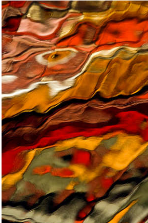
"Jupiter" by Mary Louise Ravese (Reflection in Hammered Metal)

Are you ready to take your photography to the next level? Some creativity exploration may be just what you need to unleash your inner artist.